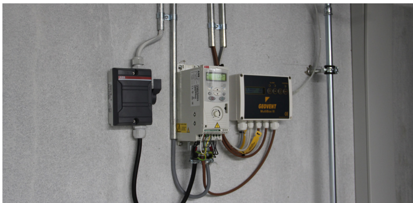
MultiBox III and Frequency Inverters