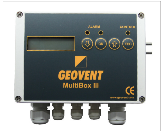
MultiBox III - Constant pressure regulation and pressure alarm

All functionalities on the MultiBox III is controlled by a powerful micro processor with a built-in EE-prom, which is used for storage of the software and the data/parameters, which are typed into it. When the processor and EE-prom are built-in, the risk of loss of data is lowered.