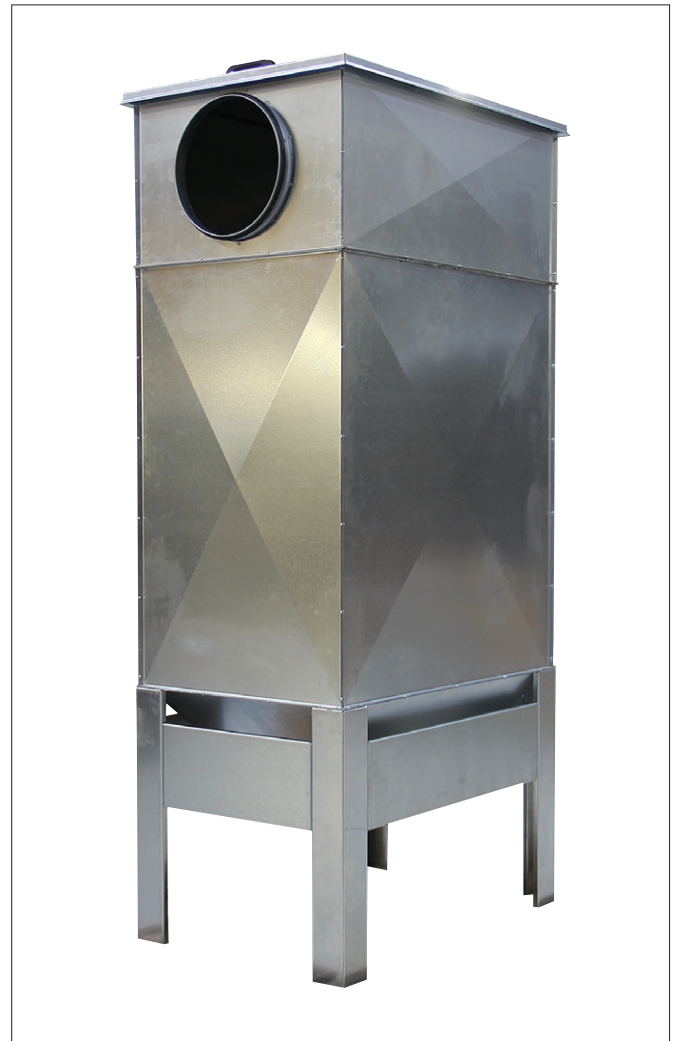
GFO – XT filter for Oil mist

Geovent Oil mist filters GFO and GFO XT need regeneration time, so the oil can drain. For continuous operation it is recommended to have 2 oil mist filters that change every 3 hours, depending on the load.