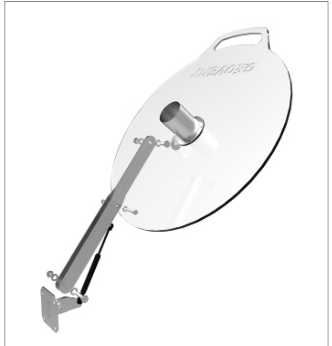
The lid is available in polycarbonate