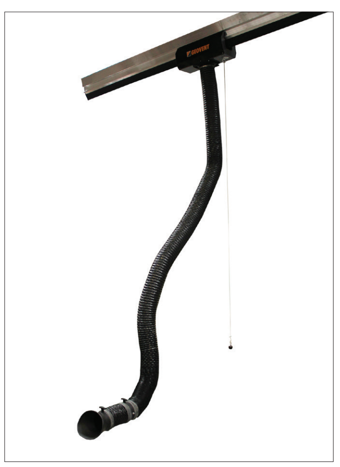
CERA Exhaust arm