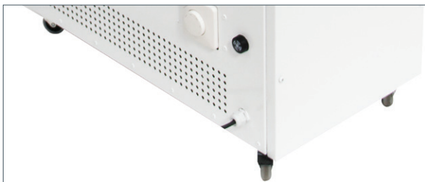
Suction control and alarm