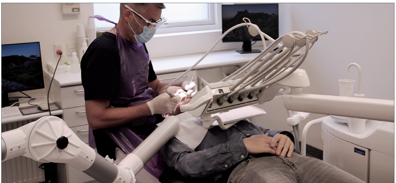
Mobile unit – GeoGo Mini White Line