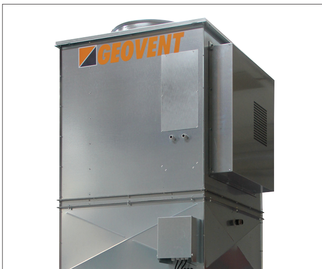
Top mounted fan mounted in built-in cabinet.