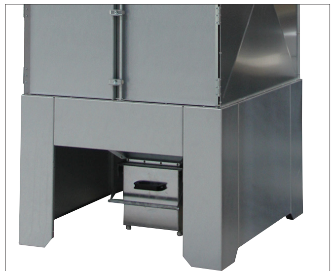
GFB2 Tower with reinforced construction and standard bucket.