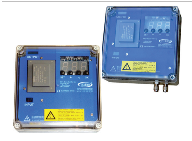
Advanced control of the filter for maximum performance.