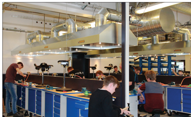
Hood with light