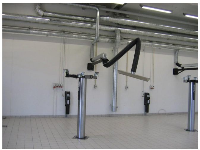
Workshop Environment with Panel fume extractor