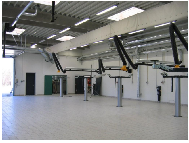
Workshop Environment with Panel fume extractor