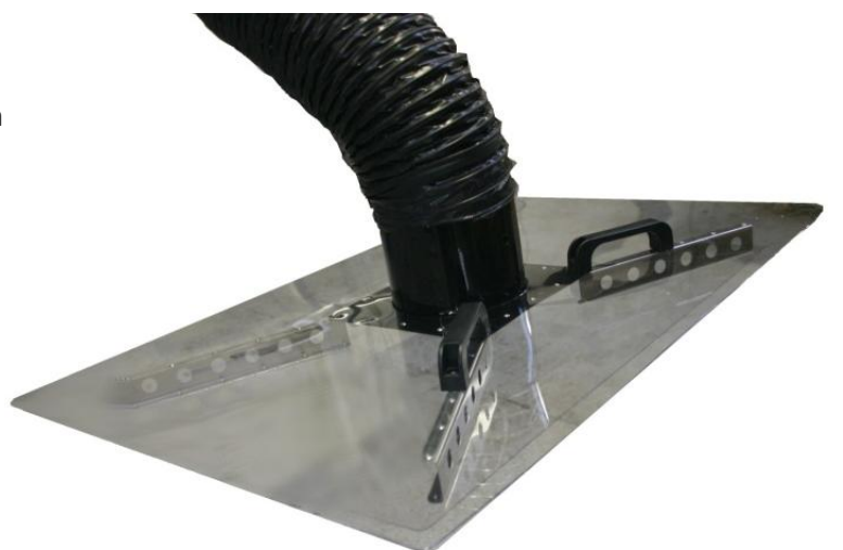
Extraction hood for windscreen gluing