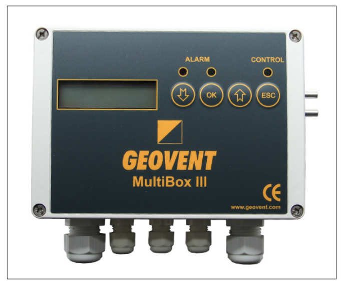
MultiBox III - Constant pressure regulation and pressure alarm

All functionalities on the MultiBox III is controlled by a powerful micro processor with a built-in EE-prom, which is used for storage of the software and the data/parameters, which are typed into it. When the processor and EE-prom are built-in, the risk of loss of data is lowered.