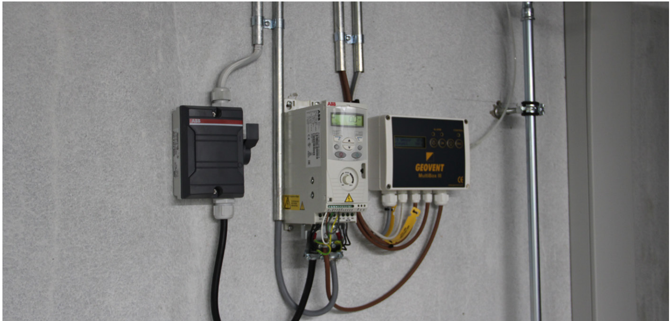
MultiBox III and Frequency Inverters