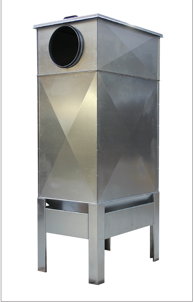
GFO – XT filter for Oil mist

Geovent Oil mist filters GFO and GFO XT need regeneration time, so the oil can drain. For continuous operation it is recommended to have 2 oil mist filters that change every 3 hours, depending on the load.