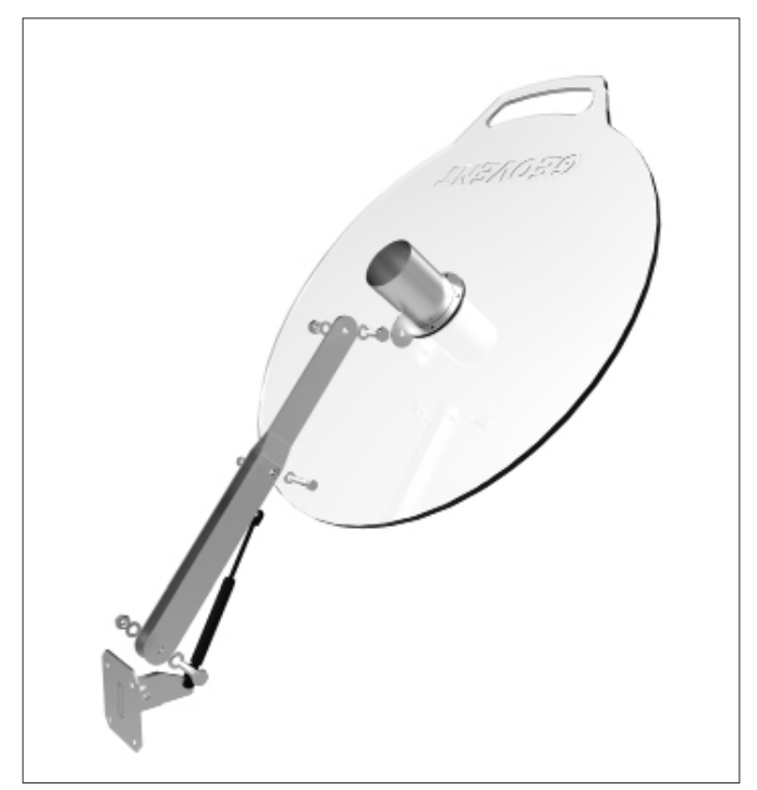
The lid is available in polycarbonate