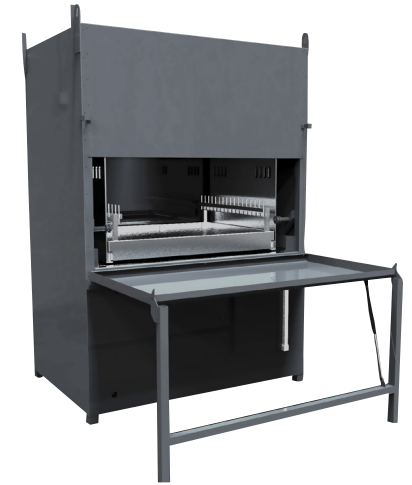
Small arms conservation cabinet. Submerges metal parts of small arms into a perservative lubricant container to protect against corrosion.