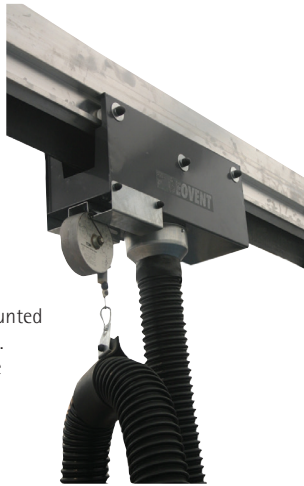
Hose trolley mounted on channel duct. Easy and flexible positioning.

Some of the extraction principles we know so well from lorry repair shop also apply to military garages. However, not many military vehicles are the same. At Geovent we specialize in developing these parts and our expertise and flexibility secure you an efficient and durable solution and at the right price.